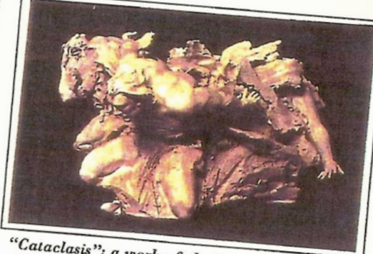
"Cataclasis": a work of clarity, ambiguity, and supreme sculptural élan.

tion as the greatest international sculptural distinction, but also conveys the richest prize, well in excess of two million yen, which has been awarded to Snowden. In addition, marble finishing techniques. The sculptor has Hakone Open-Air Museum and will become "Cataclasis" has been purchased by the