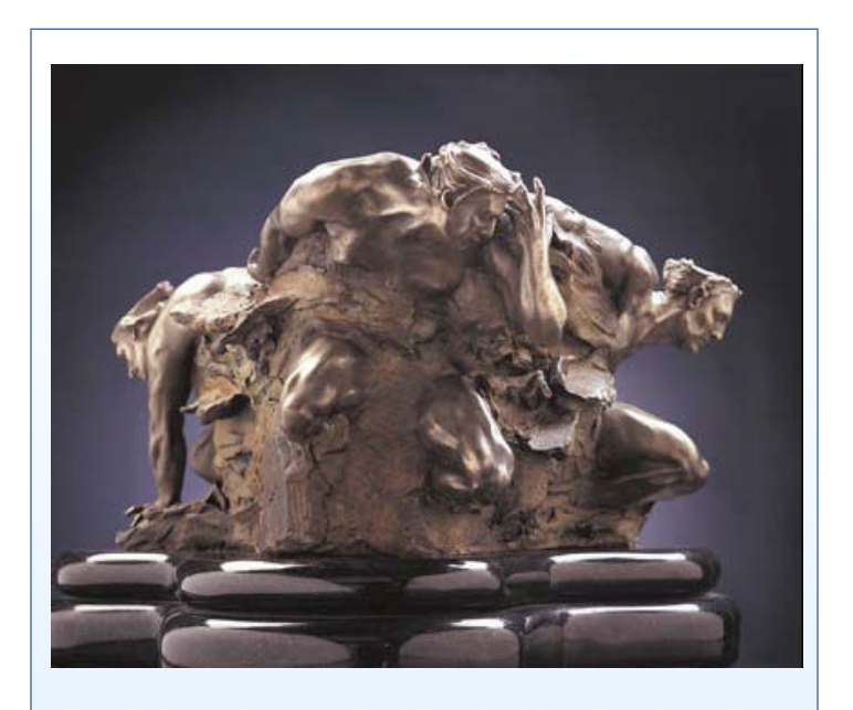
Cataclasis Study is sold out!

Twelve years later, in 2006, it was this masterpiece that was accepted into the Permanent Presidential Art Collection. And so with that we welcome you into this phenomenal time period of Art History, and thank you so much for walking with us.