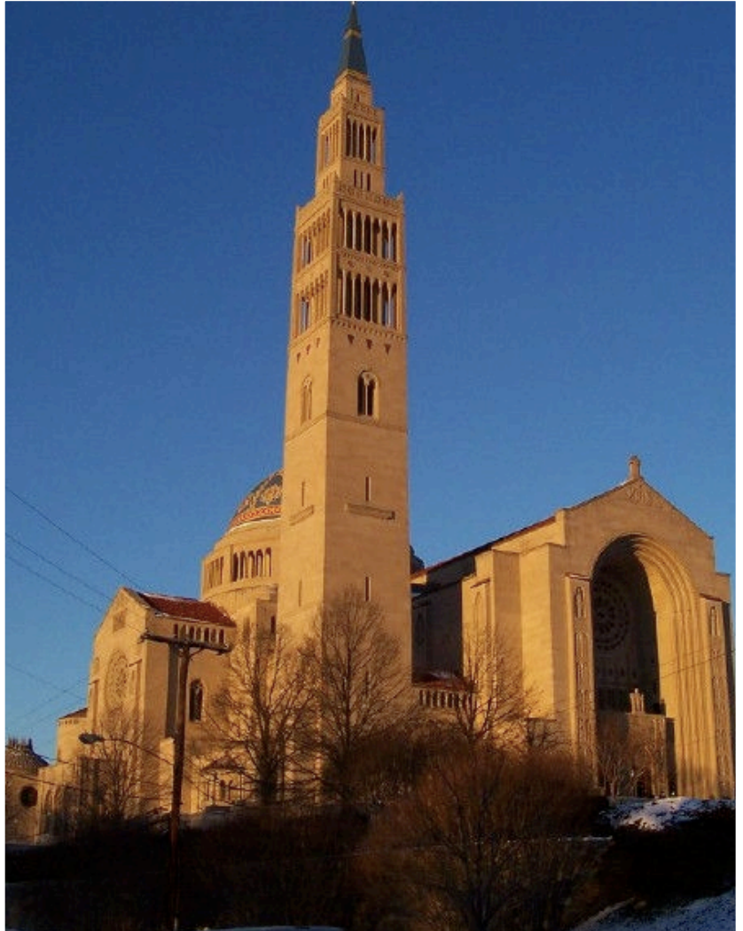
The National Shrine of the Immaculate Collection

Each of us is his own artist but the underlayment, the methods, the recounting of Rodin's words on building advice, which underscore and summarize the precepts of other sculptors in my line - and yes, the formulas, the master ways of working - all these things still run true from hand to hand, down through time."