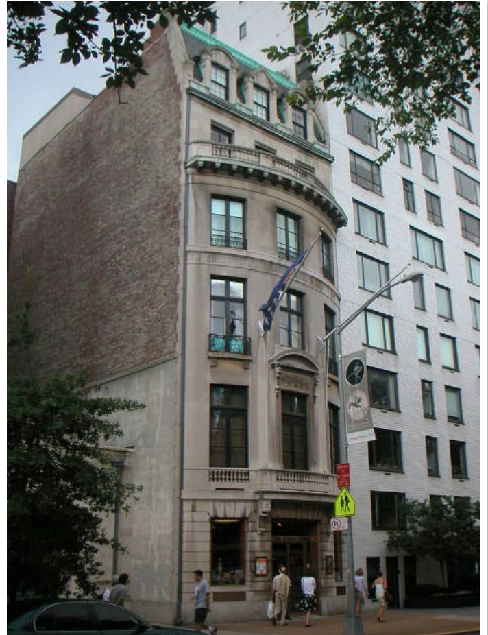
The National Academy of Design